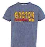
Rabbit Skins SS Navy Melange 65/35 2T 3T 4T 5/6 $15 Front & Back $13 Front only