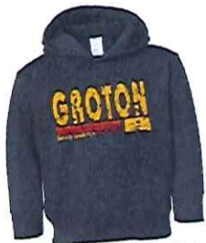
Rabbit Skins Navy Hoodie 60/40 2T 4T 5/6 $25 Front & Back $22 Front only