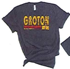
Bella CVC Heather Midnight Navy 52/48 XS - 4XL S-XL $18 (front & back) $15 front only (+$2 2XL +$3 3XL +$4 4XL)