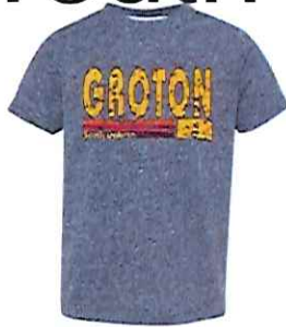
LAT SS Navy Melange 65/35 Youth XS - Youth XI $16 Front & Back $14 Front only