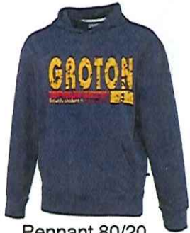
Pennant 80/20 Navy Hoodie Youth Sm- Youth Lg $32 Front & Back $30 Front only