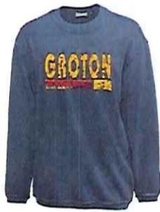
Pennant 60/40 Sandwash Crew Navy XS - 3XL S-XL $30 (front & back) $28 front only (+$2 2XL +$3 3XL)