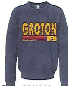
Bella 52/48 Heather Navy Crew Youth Sm - Youth L $25 Front & Back $22 Front only