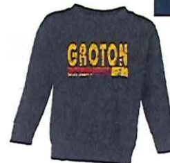
Rabbit Skins Navy Crew 60/40 2T 3T 4T 5/6 $20 Front & Back $18 Front only