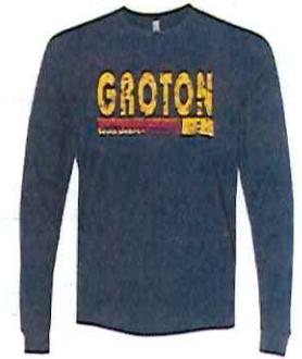
Next Level Midnight Navy 60/40 XS-3XL S-XL $20 (front & back) $17 front only (+$2 2XL +$3 3XL)