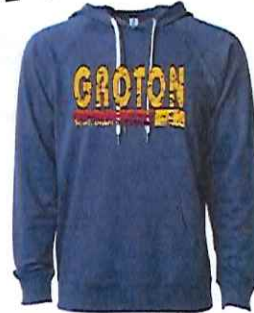
Independent Trading Super Lightweight 55/45 Hoodie Indigo XS - 3XL S-XL $25 (front & back) $22 front only (+$2 2XL +$3 3XL)