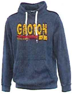
Pennant 60/40 Sandwash Hoodie Navy XS - 3XL S-XL $35 (front & back) $32 front only (+$2 2XL +$3 3XL)